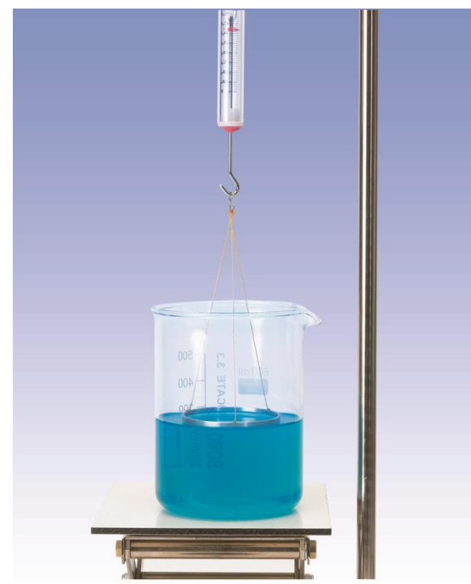
Fig. 3: Experiment set-up for surface tension measurements