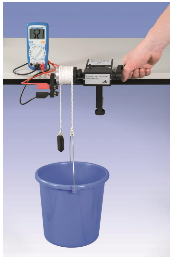
Fig. 1: Experiment set-up